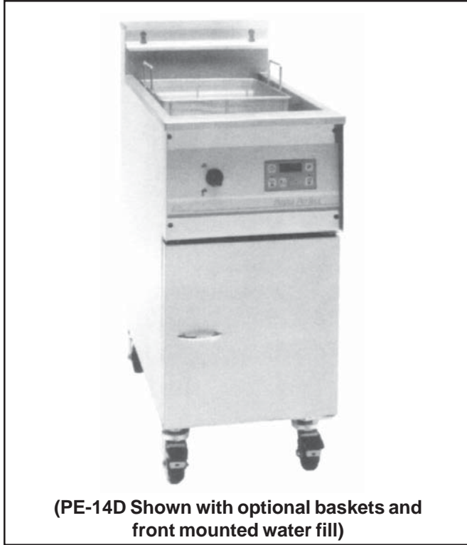
(PE-14D Shown with optional baskets and front mounted water fill)